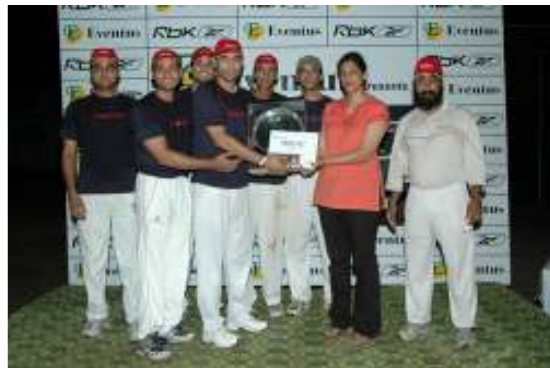
Runners-up of Reebok Plate (Aricent) →