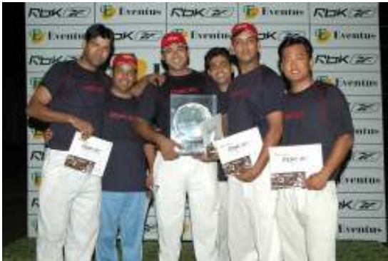
← Third Place Winners of Reebok Plate (Kingfisher Airlines who defeated Kampsax by 3 wickets)