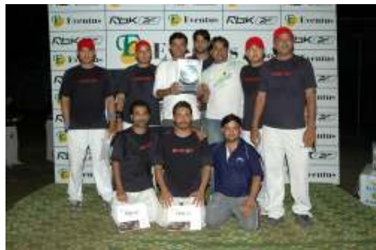
Third Place Runners-up of Reebok Plate (Kampsax) →