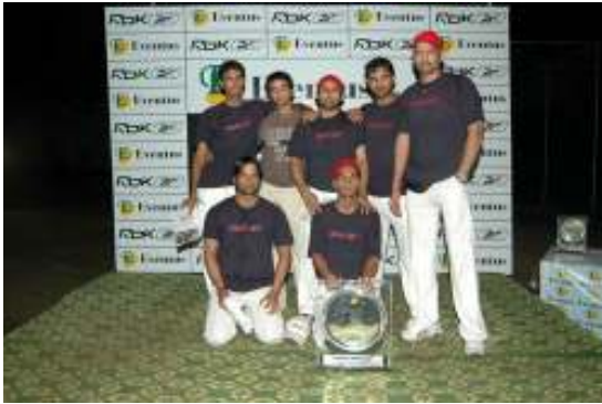
← Winners of Reebok Plate (Luminous Technologies who defeated Aricent by 5 wickets)