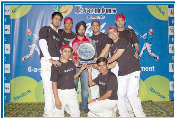
Winners: Aricent Technologies

GE Money Servicing defeated Reebok-IV by 6 wickets in a 3rd Place match of Reebok Plate.