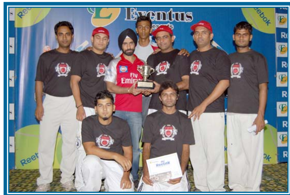
3 rd Place Runners-up: Steria