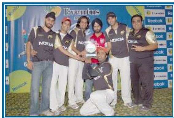
3 rd Place Runners-up: Reebok-IV