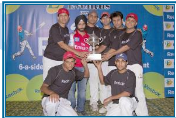
Runners-up: Nokia Siemens Network