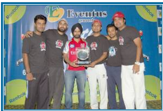
3 rd Place Winners: GE Money Servicing