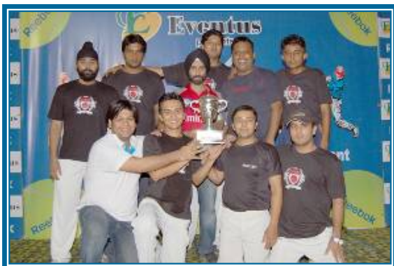
3 rd Place Winners: ICICI Bank