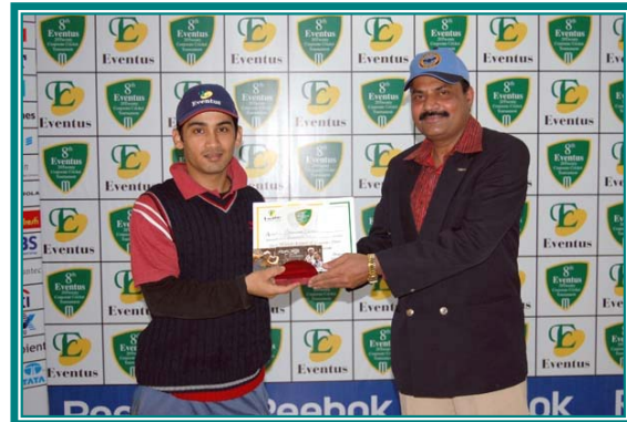
↑ Best Wicket Keeper