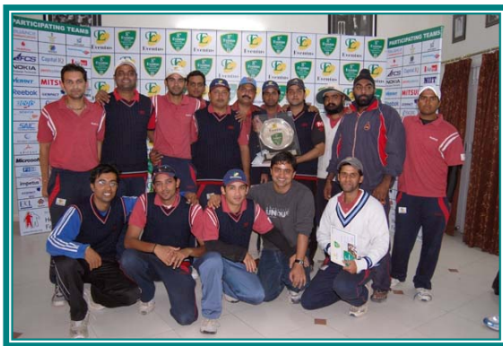
↑ Winner - Vodafone