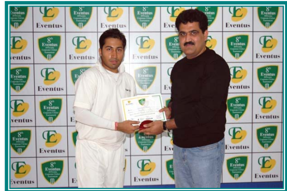
↑ Best Wicket Keeper