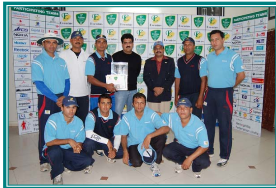
Runners-Up - Indian Air Force

The players who performed exceptionally well during the tournament were short listed on the basis of their performance during knockout stage only. The categories along with the performance are given below for your kind perusal in Eventus Cup.