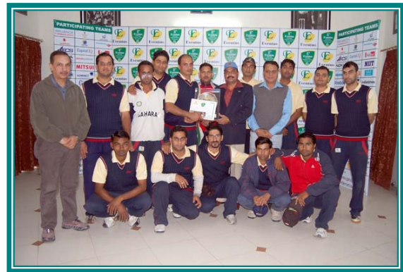
↑ Runners-Up - Reliance Communication

The categories along with the performance are given below for your kind perusal in Eventus Plate.