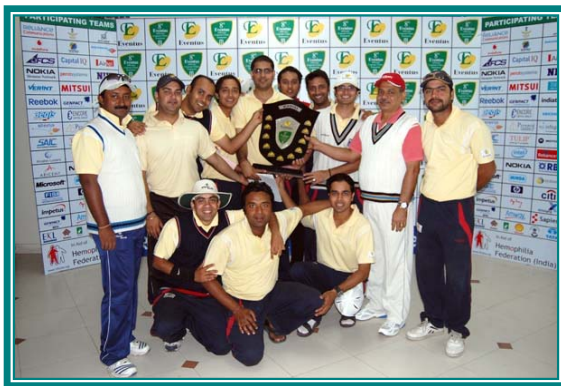
↑ Winners- Bank of America