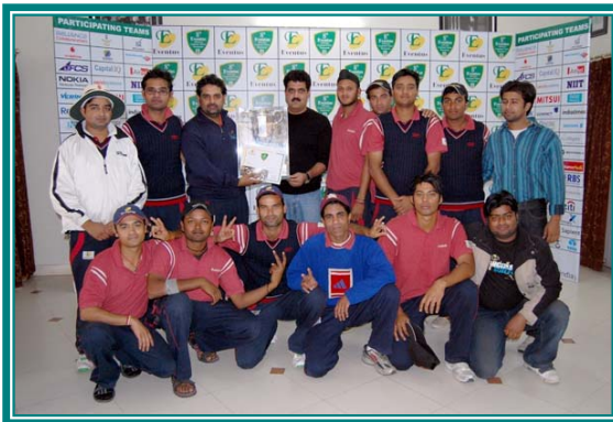
Winner - Opto Group