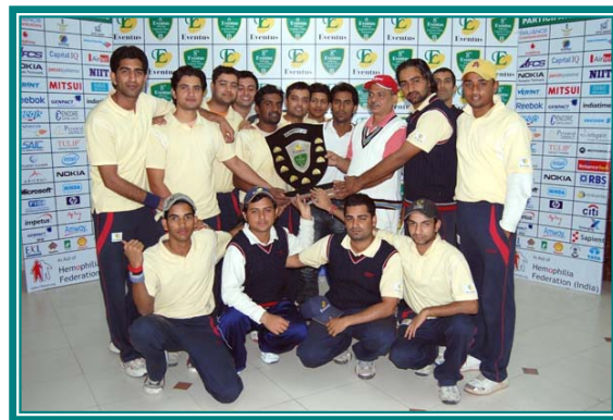
↑ Runners-Up- Wipro BPO

The categories along with the performance are given below for your kind perusal in Eventus Shield.