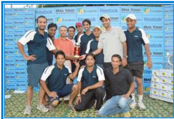
Winners of Reebok Bowl: Genpact

After playing 2 league matches, top 2 teams amongst the 3 teams in each pool qualified for Reebok Bowl whereas the teams who stood at last spot fought for Reebok Salver. 26 teams played for Reebok Bowl while 13 teams clashed for Reebok Salver category.