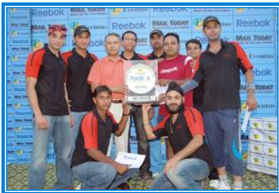
Winners Salver: Max New York Life