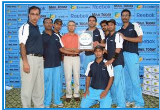
Runners-up Salver: Lanco Infratech