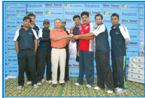
Runners-up of Reebok Bowl: Reebok-I